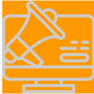
Digital, video, social and content publishing