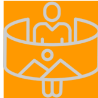
360-degree web visibility