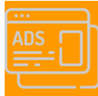
Most effective outreach